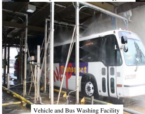
Vehicle and Bus Washing Facility