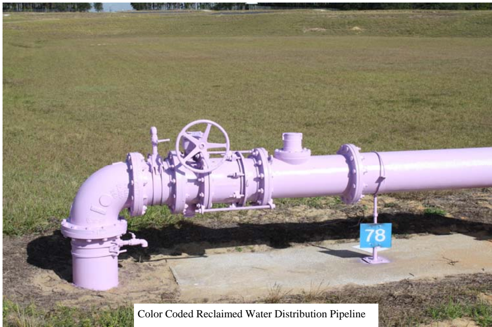
Color Coded Reclaimed Water Distribution Pipeline

Reclaimed water is delivered to the RCID customers through a distribution system of underground pipes, very similar in size and extent to that of the potable water distribution system. The pressure of the water in both systems is nearly identical. The pipes of the reuse distribution system are color coded purple, by pigmentation, paint, or striping and tape. Purple pipes, hydrants, valves, valve boxes and fittings identify the reclaimed water system throughout the RCID. The purple designation is a State requirement and is an important measure to guard against cross connections with other piping systems, and other unintended uses.