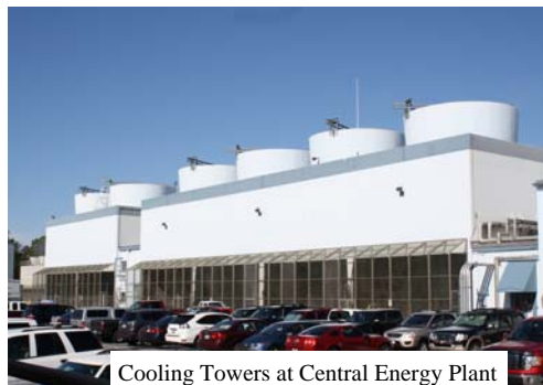
Cooling Towers at Central Energy Plant